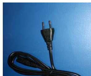
240 VAC / 50 Hz / CEE 7/16 Euro Plug