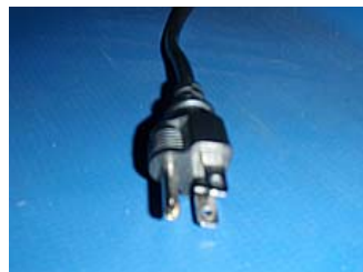
120 VAC / 60 Hz / NEMA 5-15 Plug