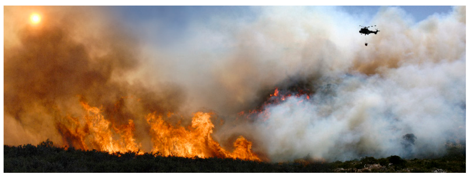
The Bambi Bucket is used in more than 110 countries around the world by more than 1,000 helicopter operators.