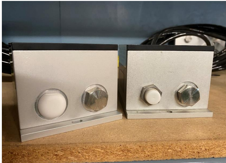
Figure 1: IVC 2 and IVC 1

A Voltage Clamp is not required on IVC 2s that have the letter “K” marked on the back of the motor as shown below (see Figure 2).