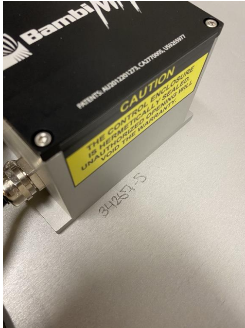
Figure 3: Serial Number Location

A Voltage Clamp is also not required for MAX valves that have a Serial Number (located below the caution label) above and including S/N 34267-5 (see Figure 3).