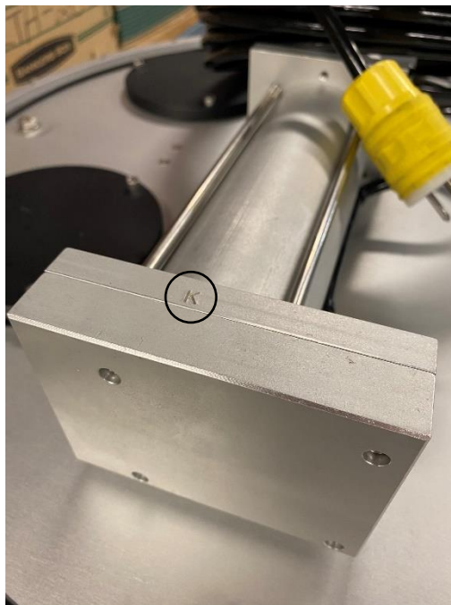
Figure 2: Motor Marked with the Letter "K"

A Voltage Clamp is not required on IVC 2s that have the letter “K” marked on the back of the motor as shown below (see Figure 2).