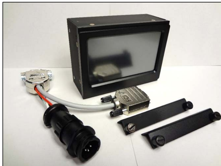
Figure 1 - SFC with DZUS mounts and Adapter

The SFC is operated with a glove compatible touch screen. The SFC includes an adapter that connects to the existing Sacksafoam wiring harness and includes a D-sub connector that can be used to connect with a remote injection switch. See Figure 2 for details.